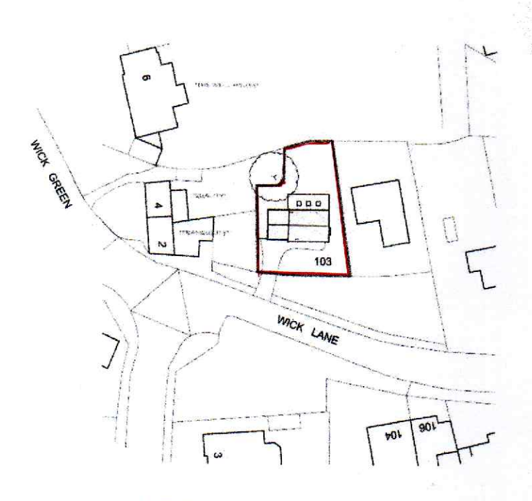
SITE PLAN (including roof plan) 1:500